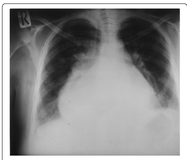
Figure 5 Postoperative chest x-ray showing reduction of cardiothoracic ratio.

fibrillation and left to right shunt [2,3,5]. Rarely, it can be seen in patients with normal mitral valve function [2].