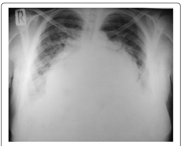
Figure 1 Preoperative chest x-ray showing marked cardiomegally and widening of the carina.

minimal blood loss. She stayed in ICU for 3 days, during which intensive chest physiotherapy was performed. The patient was discharged after 12 days.