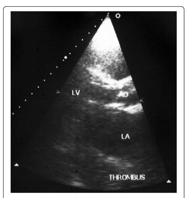
Figure 2 Preoperative echocardiography showing a huge left atrium occupied by a thrombus.

Follow-up by TTE and chest X-ray two weeks after surgery showed a well functioning prosthetic valve, clear left atrium with an estimated size of 9 \times 9.8 cm (Figure 4). Both lung fields were clear with reduced cardiothoracic ratio (Figure 5).