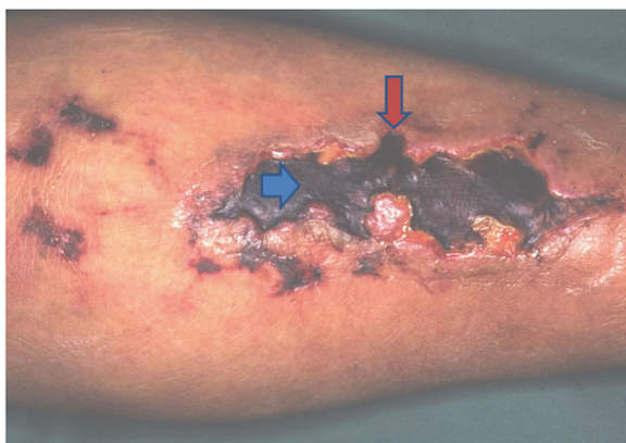
Fig. 1 This demonstrates a typical skin lesion secondary to calciphylaxis. Note the necrosis of the ulceration and the development of eschar. The red arrow points to the border of the ulceration. The blue arrow demonstrates the eschar.

Calciphylaxis is a rare and life-threatening disorder consistent of skin ischemia and necrosis. It mainly occurs in ESRD patients and the prognosis is very poor. It is characterized by skin lesions that begin as painful nodules and progress to necrotic ulcers that often become superinfected (Fig. 1). They tend to develop in areas with the most adipose tissue as was seen in our patient who developed lesions in his thigh. The diagnosis is confirmed by biopsy that reveals arteriolar occlusion and calcification with no vasculitic changes (Fig. 2). The optimal management is not known but involves wound care, treating hyperphosphatemia and secondary hyperparathyroidism and administering sodium thiosulfate. Sodium thiosulfate has been shown to resolve or